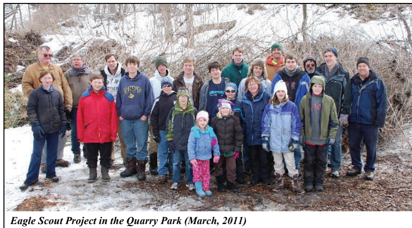
Eagle Scout Project in the Quarry Park (March, 2011)