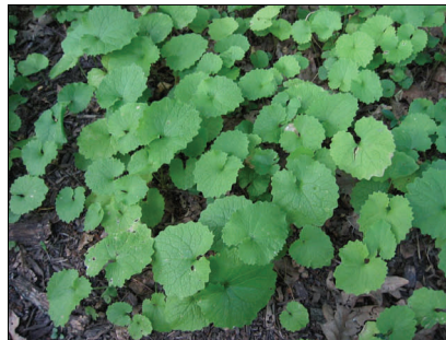
Garlic Mustard in the Spring

If you choose to use an herbicide like 'ROUND-UP', its best to spray in April when the plants are young. Spraying plants that are already flowering is not as effective and the plant will most likely still go to seed. Spraying early also reduces the chances of killing desirable plants that have not emerged yet.