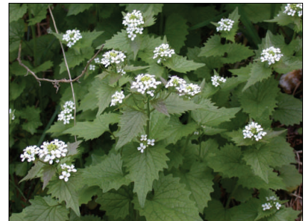
Flowering Garlic Mustard