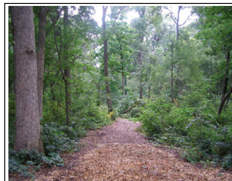
Koval Woods Trail