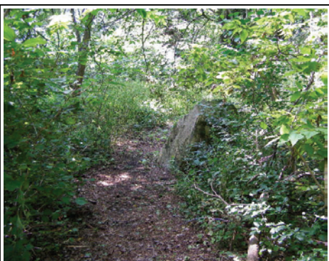
Quarry Park Trail

Walking Paths in the Parks – Take your family and enjoy a walk through one or more of the Village Parks. The Quarry, Reese Woods, Koval Woods, Four Corners Park, and Post Farm Park all have small foot trails that have been recently cleared.