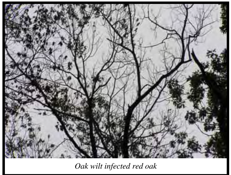
Oak wilt infected red oak

The two-lined chestnut borer is most assuredly active within Shorewood Hills. Many of the oak trees removed recently by the Village have been riddled with the larvae. The two-lined chestnut borer typically attacks trees that are already stressed. This is another important reason to maintain your trees through watering, mulching, and proper pruning.