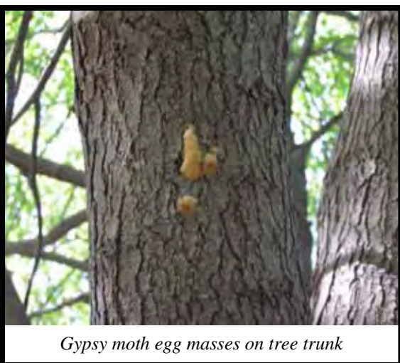
Gypsy moth egg masses on tree trunk